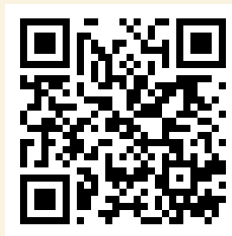
All UA job listings

You must apply for a job, get hired, and clock hours in order to receive your work-study award.